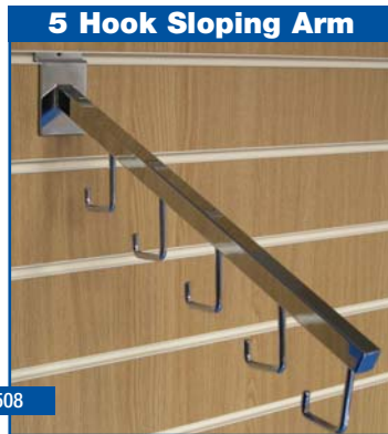
5 Hook Sloping Arm