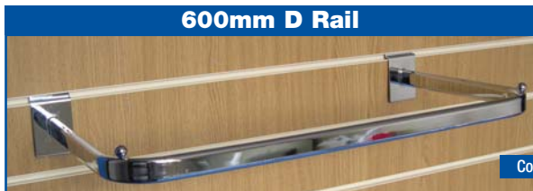
600mm D Rail