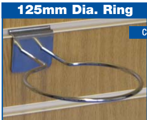
125mm Dia. Ring