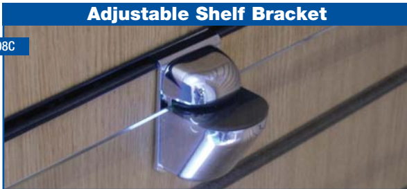
Adjustable Shelf Bracket