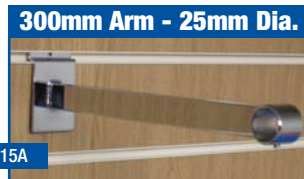
300mm Arm - 25mm Dia.