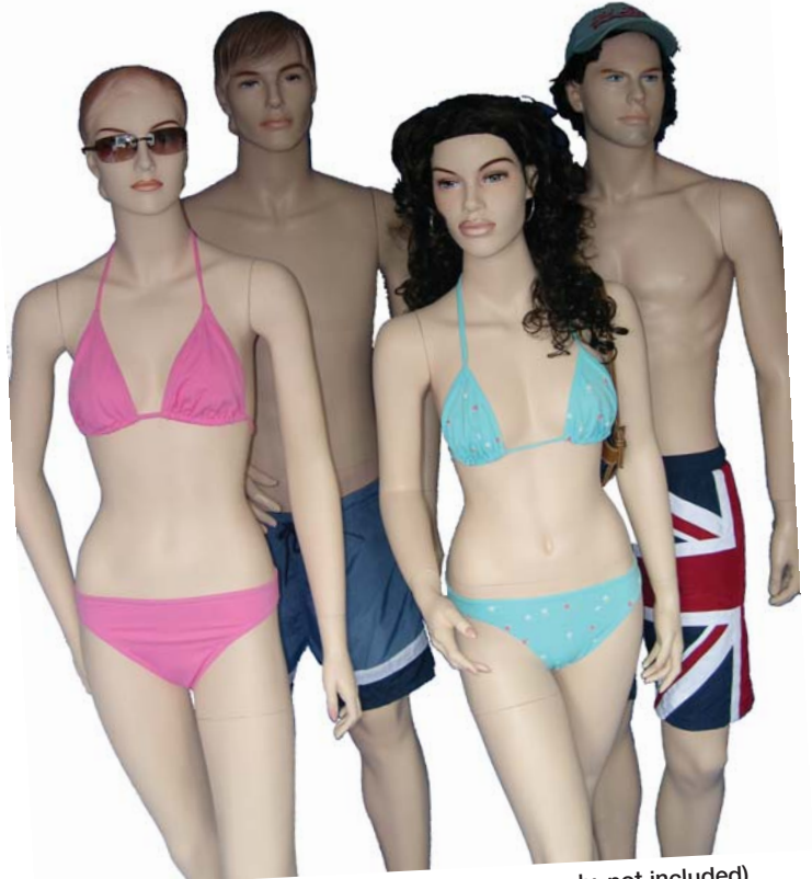
(Clothing and accessories for display purposes only, not included)