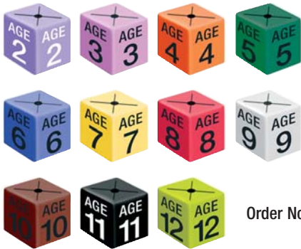
Order No. Size Cube