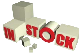
Order No. TG

Tagging Gun for fast and secure ticketing and marking of all textile goods.