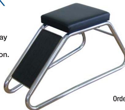
Order No. R177

Ideal for shoe shops. Size: 750mm long Chrome base with black seat.