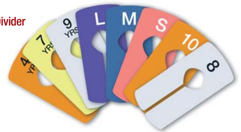
Order No. Rail Divider